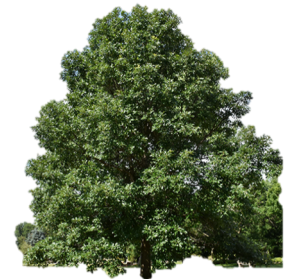
Swamp White Oak